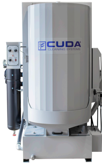
Shown with options