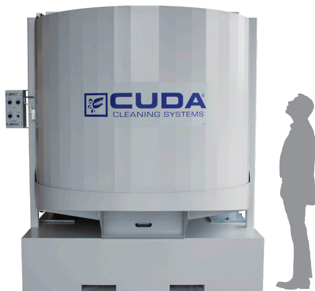
Approx. scale to 7248 model